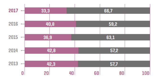
Figure 1. Percentage of renewable energies (left part of the bars) in the power production system in Spain along the last five years. Renewables count for hydro, wind, solar PV and thermoelectric, other renewables and 50% of waste urban [1].

Though the plans for the installed capacities are ambitious, i.e. in 2020 - 35.0 GW of wind and 7.25 of PV [2], and in 2035 - 46.1 GW of wind and 37.0 GW of PV [3], since 2013 there was almost no increase in the installed generation capacities of renewable energy systems.