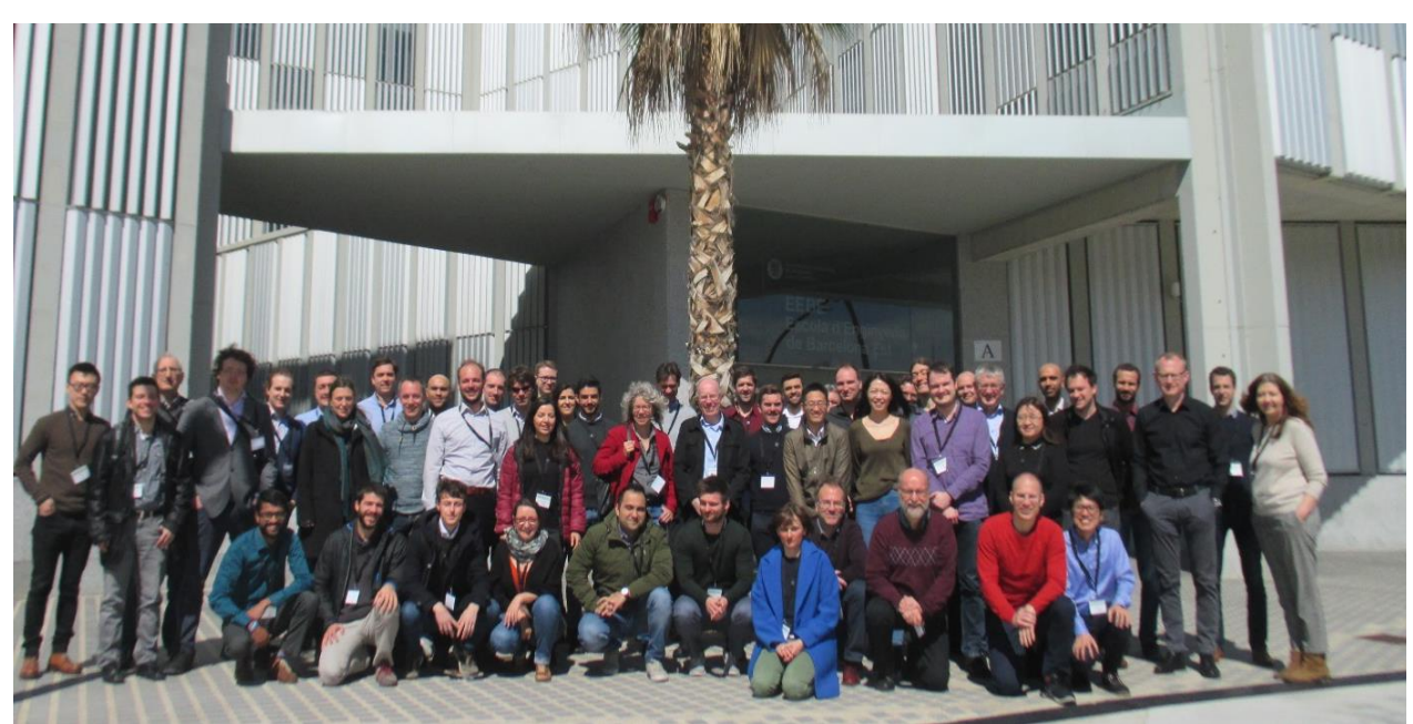
The participants of the 6<sup>th</sup> working meeting of Annex 67

Hence, when using the direct simulation approach, it comes down to define a good penalty function. Further research is needed to identify what are the prerequisite of the penalty signal since it will influence the flexibility estimation. As next steps for the common exercise, in support of the further development of the cookbook, is n intensive work-group planned in May 2018.