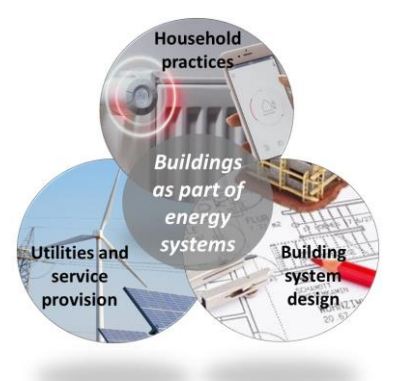
Figure 3. Three key domains in integrating buildings into energy systems

The vision of the InterHUB project is that the future buildings will be an active and integrated part of the energy system. This will have implications for everyday household practices, the ways in which buildings and their associated technologies are designed and for the ways in which energy providers operate. The roles of the involved actors will change, e.g. utilities will become service providers rather than energy providers, consumers will take roles of prosumers (both providing and consuming energy), and buildings will serve as energy storage units and energy producing units. These changes call for increased collaboration and an aligning of practices across each of these domains, as indicated in Figure 3. Thus, central research topics to be investigated are: how households interact with and understand different types of building technologies, how households relate to utilities providing different services, how different types of professionals communicate with each other and with households on energy issues, and how developments within buildings and provision systems influence each other.